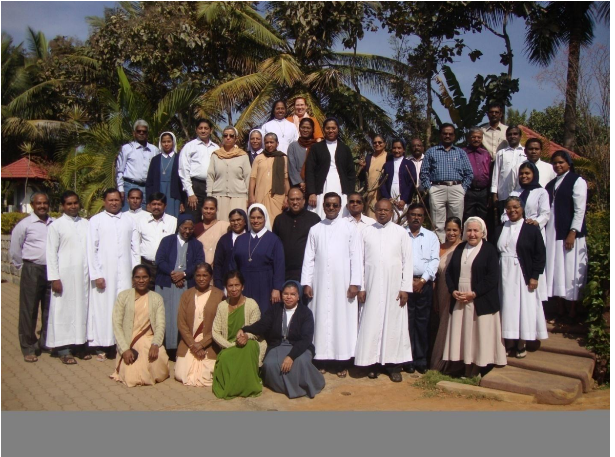
Participants at 6 th National Vincentian Family Meeting held at Bangalore on 21 st & 22 nd January 2012